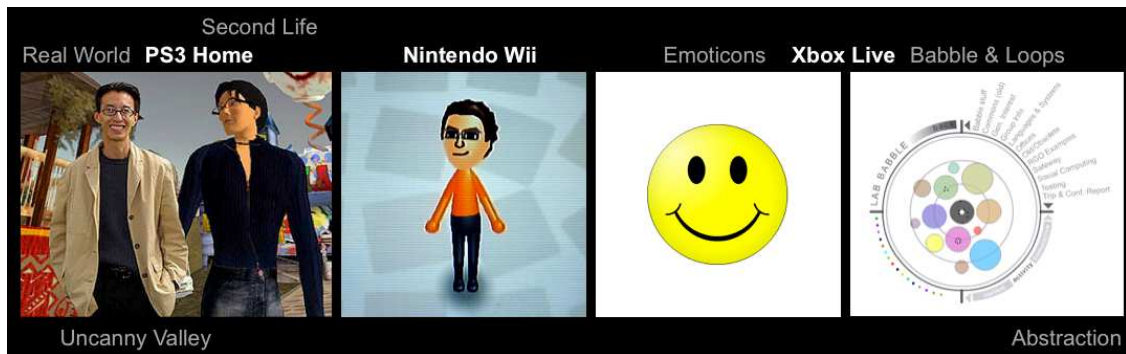
Figure 2: Spectrum of representation

While resolving the question of where human representation ends and non-human representation begins is beyond the scope of this article, perhaps it is safe to say that the notion of human embodiment may be more strongly bound to our perception of each representation than the level of detail in the representation itself. And our perception is deeply informed by the context each representation appears in.